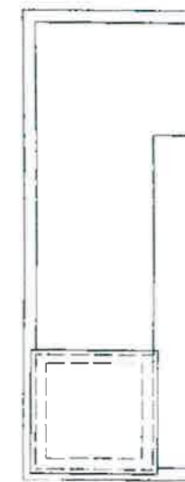
Haus Nr. 22